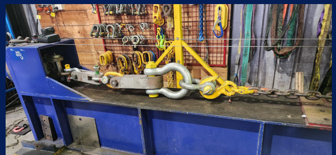
Rope attachment undergoing load testing during overhaul.

At Becker Mining Australia, our team specialises in comprehensive rope attachment overhauls and delivers quality spare parts, ensuring the optimal performance and longevity of your mining operations.